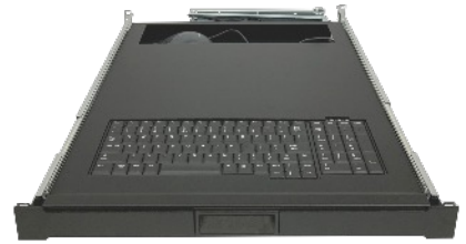
Shown with optional mouse RMK-221N1M