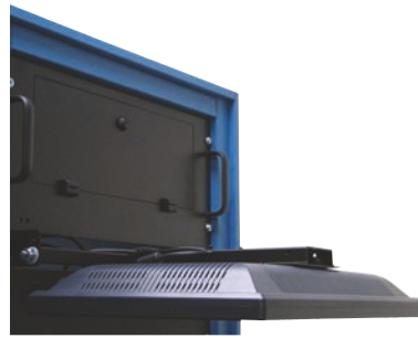
RMVM-100 Mounted so monitor tilts down.