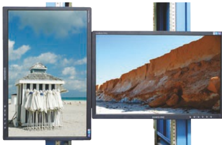
Dual 22" Monitors