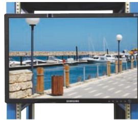
Single 24" Monitor