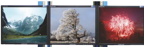
Triple 17" Monitors