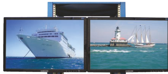
Dual 24" Monitors