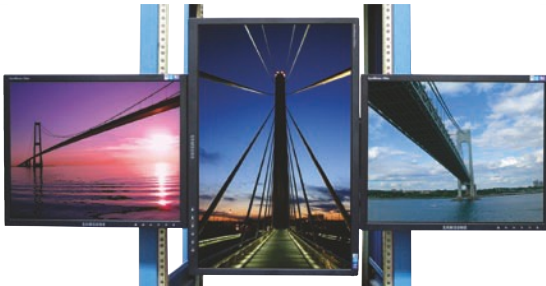
Dual 17" and Single 22" Monitors