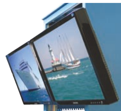
Dual 24" Monitors tilted down for improved viewing.