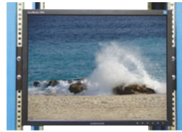
Single 20" Monitor